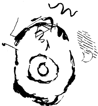
EMERGING FROM ARBITRARY VARIABLES